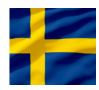
Sweden formation £2,519.00 More Information