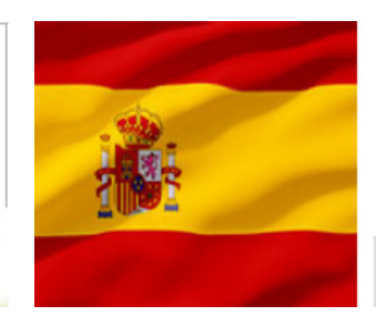
Spain formation £3,019.00 More Information